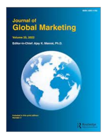
Journal of Global Marketing