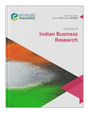
Journal of Indian Business Research