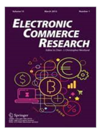
Electronic Commerce Research