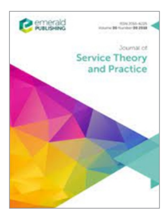
Journal of Service Theory and Practice