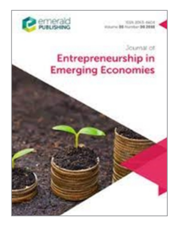
Journal of Entrepreneurship in Emerging Economies